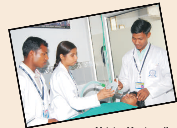
Helping Hands to Cure