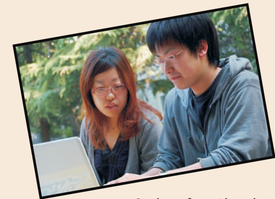
Students from Abroad