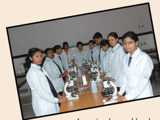
Learning beyond book