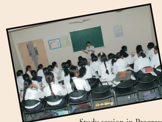
Study session in Progress