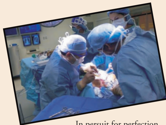
In pursuit for perfection