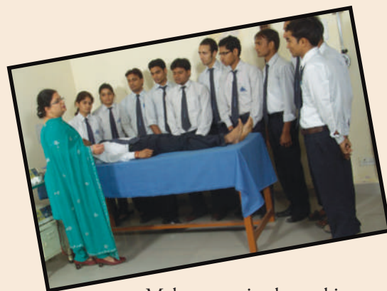
Male nurses in the making