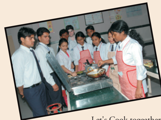
Let's Cook together - Nutrition Lab