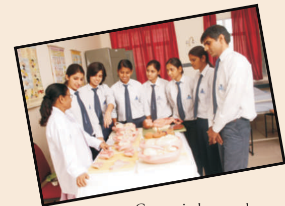
Great minds at work