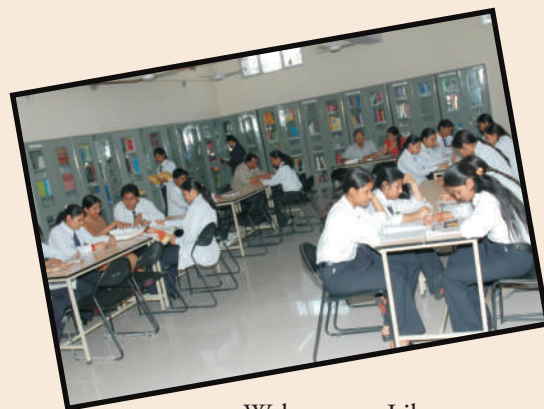
Welcome to Library