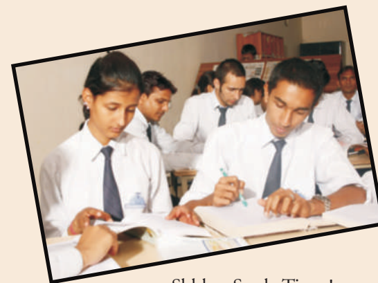
Shhh... Study Time !